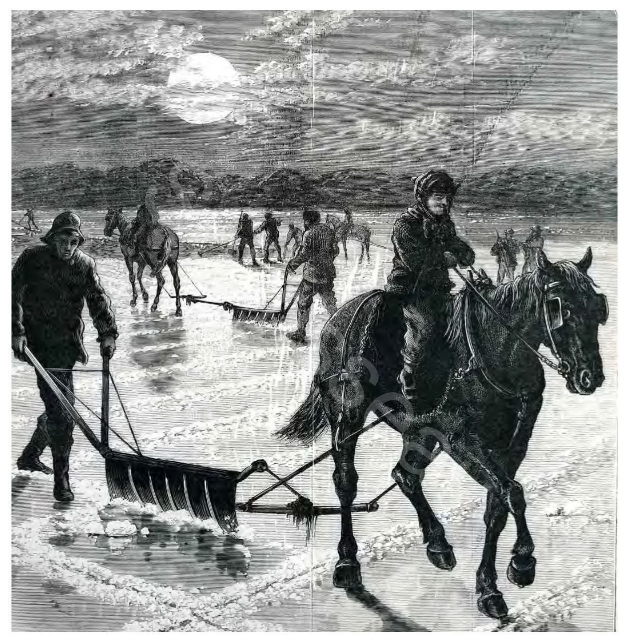
[161] Harvesting Ice. During the early 1850s, ships loaded with Alaska ice were delivering their frosty cargoes to the Bay Area. By the late 1860s, train cars loaded with block ice, cut from ponds and lakes in the high Sierras, were dripping their way down to the Santa Clara Valley, not only to cool the drinks in high end saloons, but also to supply our early ice cream parlors.