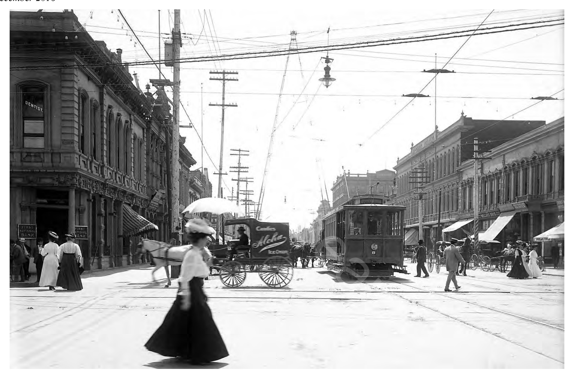
[165] Aloha! In 1893, American colonists overthrew the Hawaiian Kingdom; and in 1898, Hawaii became a Territory of the United States. Four years later advertisements describing perpetual summer and romance were appearing in mainland magazines, urging tourists to California to travel just a little bit further when they were Out West! By 1907, piggybacking on that newly-revealed island paradise, an entrepreneur was delivering buggy-loads of locally produced Aloha brand ice cream to the fountains and restaurants of downtown San Jose.