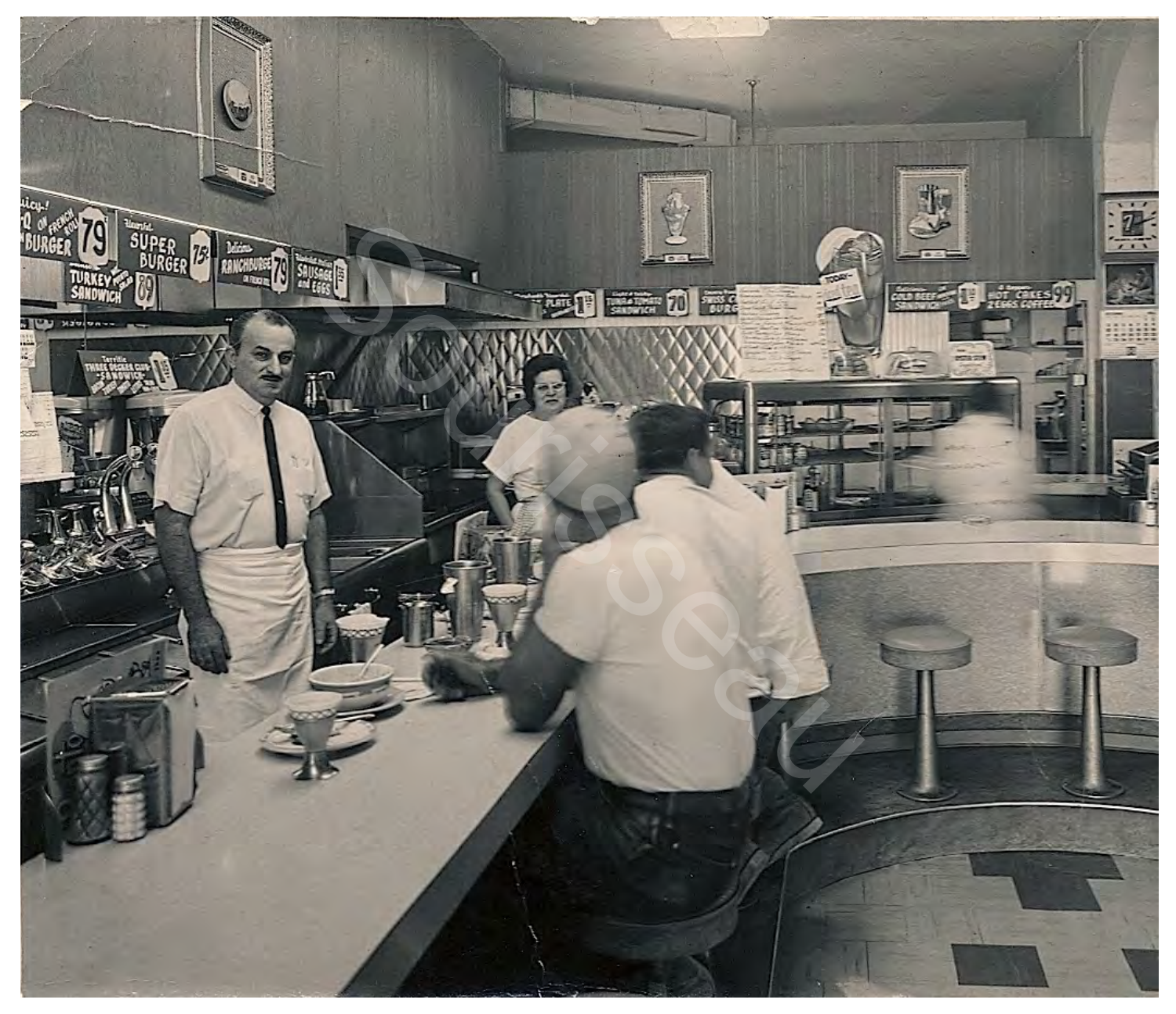
[173] Hotdogs, too! You could still sit down, however, and enjoy a hotdog and a sundae at a plethora of luncheon counters like the Pronto Pup on Lincoln Avenue in Willow Glen.