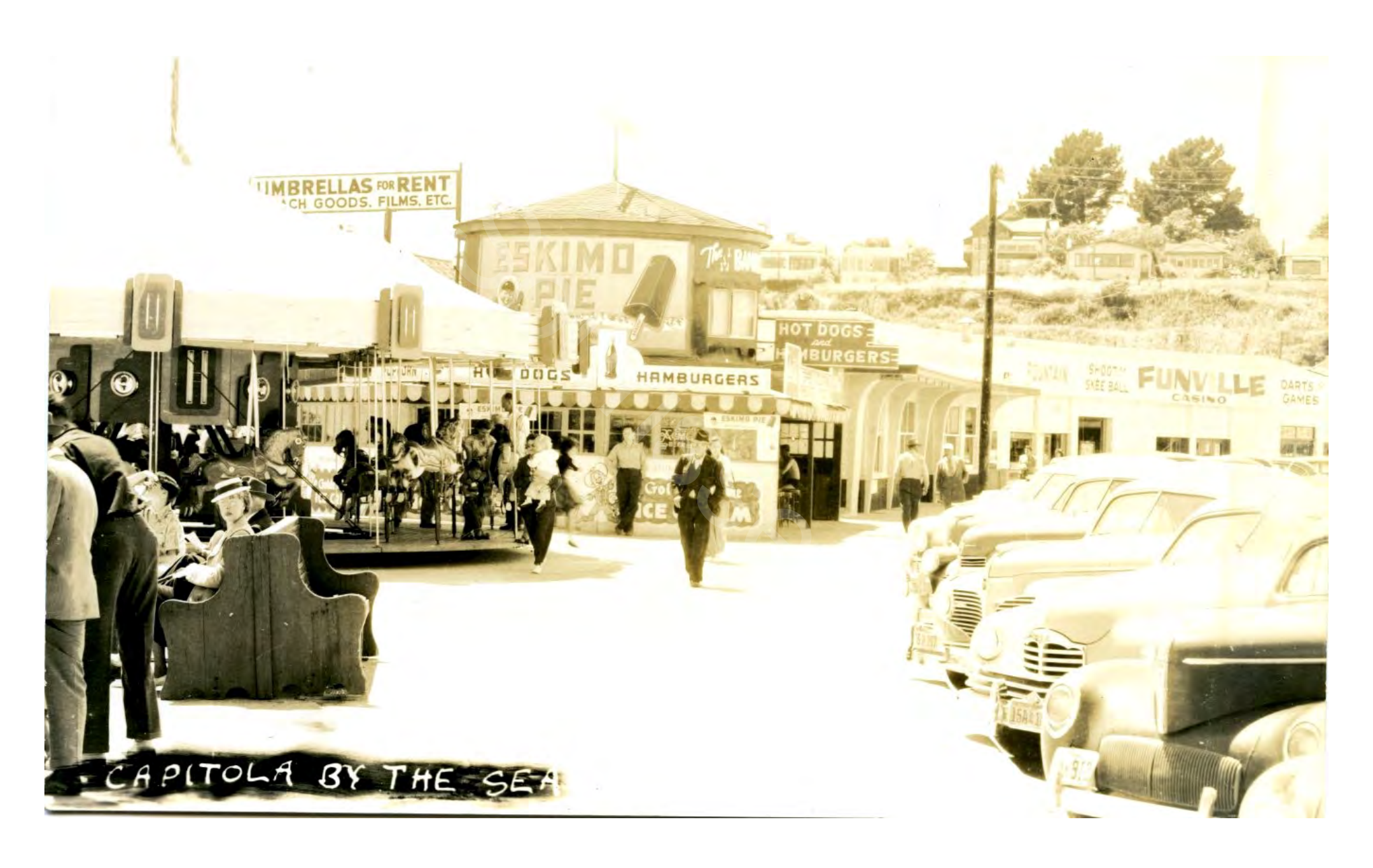
[169] Ice cream on a stick! By 1948, Eskimo Pie on a stick was the most prominently advertised frozen dessert at Capitola-By-The-Sea.