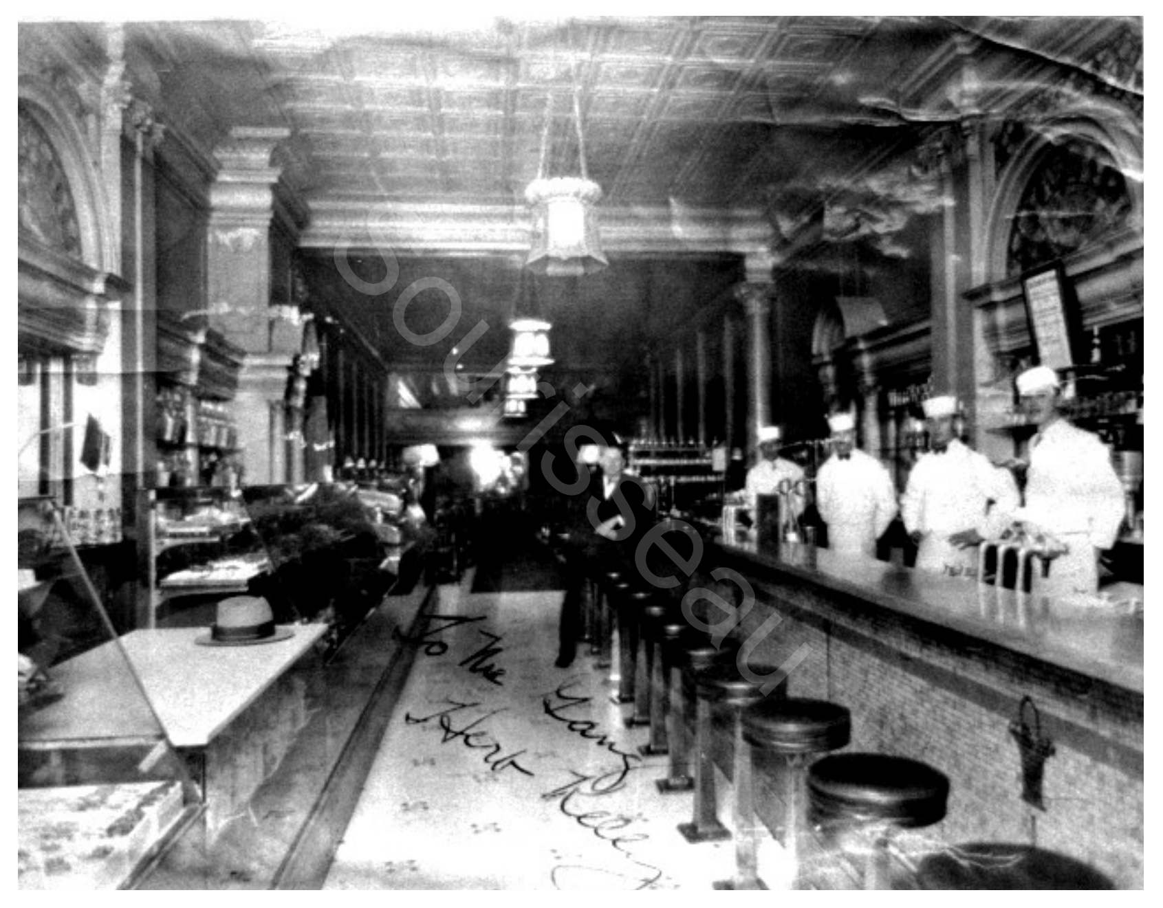
[163] Before the Earthquake! By 1900, it required four uniformed soda jerks to staff the fountain side of O'Briens!