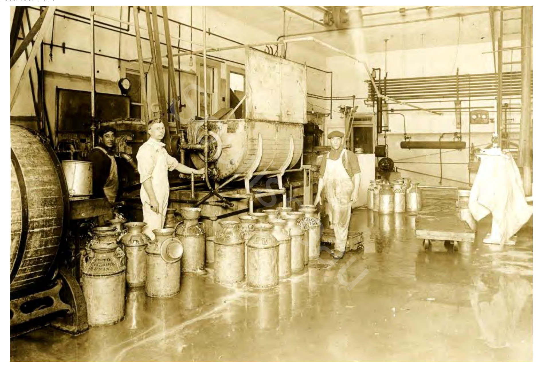
[167] Mass Production. By the late 1920s, San Jose's Independent Creamery & Ice Cream Company was purchasing immense quantities of cream to support the manufacture of its Eatmore brand ice cream!