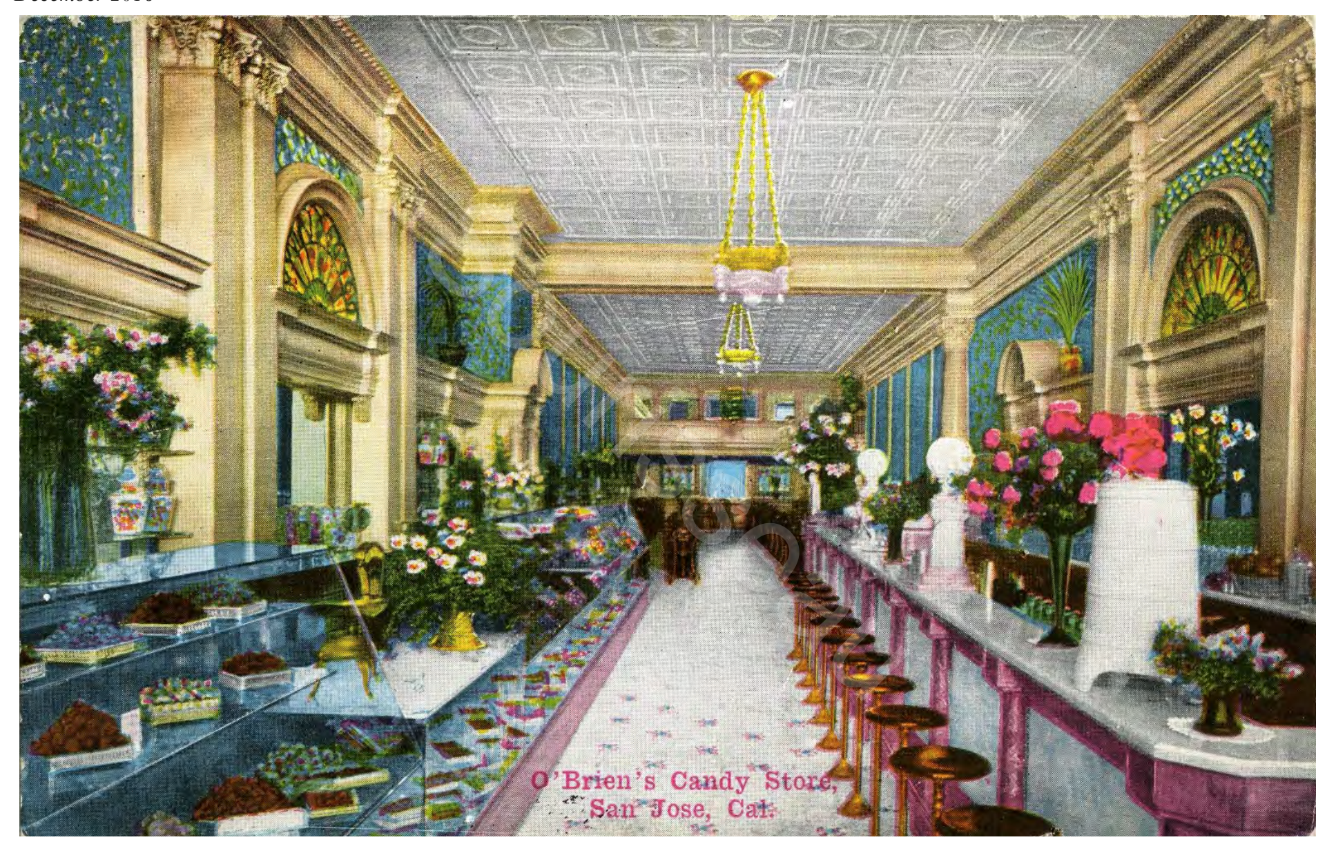
[164] Repaired and improved! When O'Brien's reopened after the 1906 Earthquake with floral bouquets on every surface, at least for this photo, it featured new chandeliers, new stools, and a new fountain counter with decorative counter supports. Within two decades, however, the San Jose ice cream experience (no longer the exclusive domain of candy stores) was dominated by fountains and creameries and, yes, pharmacies!