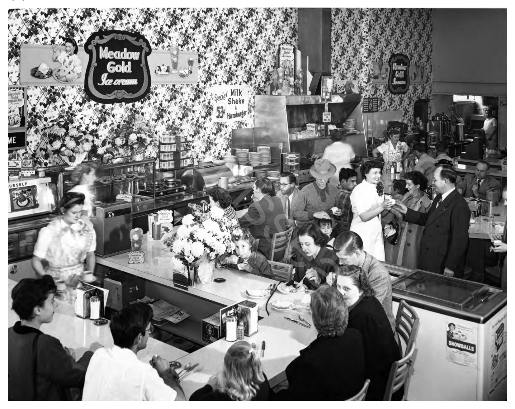
[171] The Parlor Experience! The early 1950s saw this unidentified San Jose ice cream parlor feature U-shaped counters for efficient service!