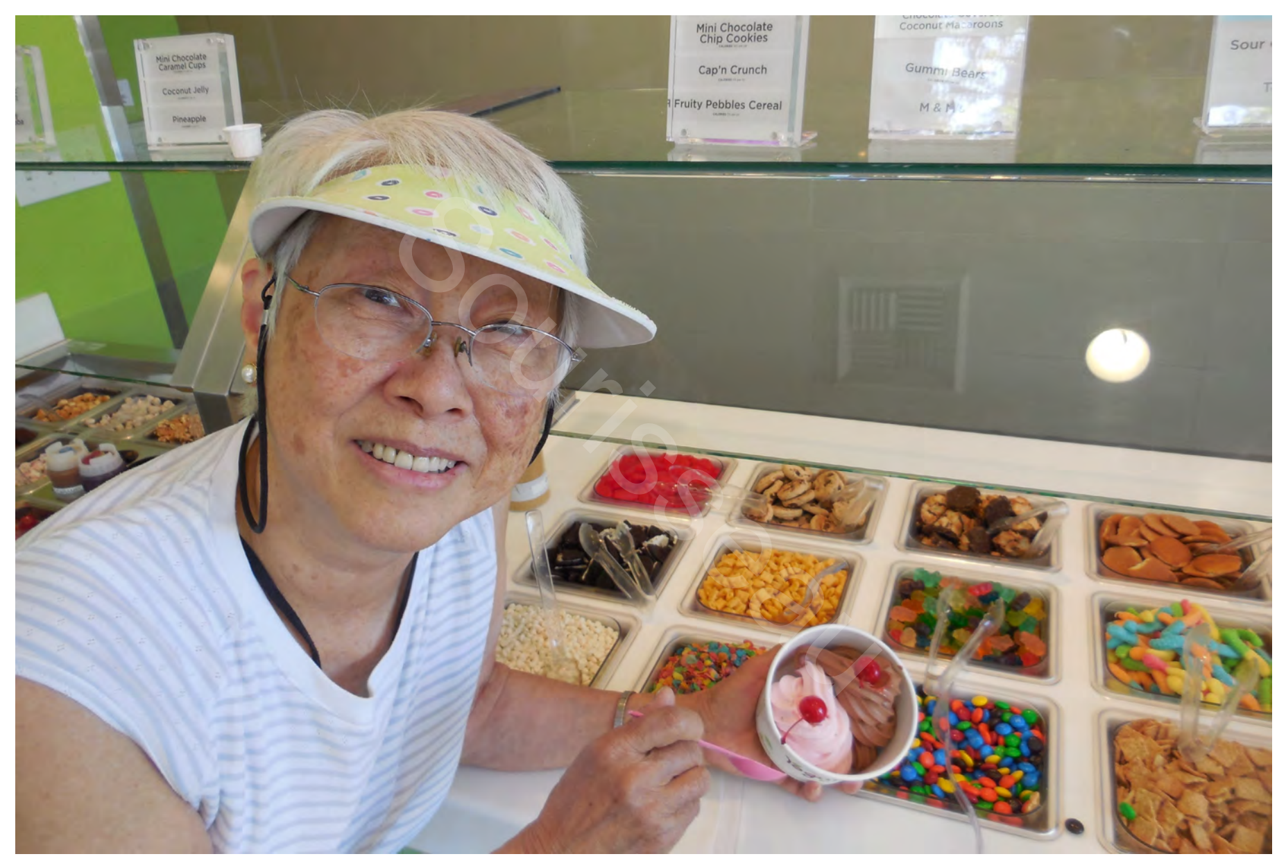
[174] Do it yourself! Today, the iconic banana split sundae (invented in 1904) seems to have fallen out of favor. But, if you're willing to do it yourself, you can still access most of the traditional ingredients except, of course, ice cream at a self-serve frozen yogurt shop!