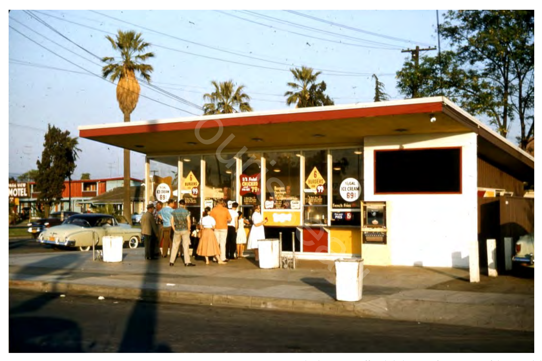
[160] Burger Bar #1 . In Summer 1955, San Jose's Burger Bar #1 at 1101 South First Street offered six burgers for 99 cents. If the essential milkshake wasn't enough, you could take home a half-gallon of ice cream for 69 cents. You may be surprised, however, to learn that ice cream has a much longer local history than does the hamburger, which was only invented in 1900!