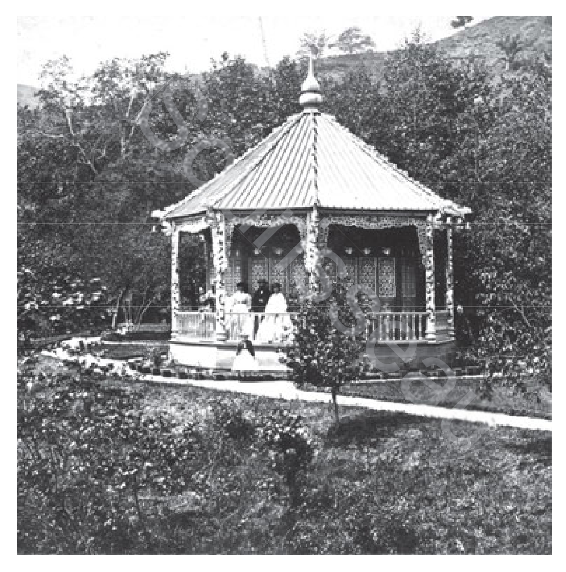
53) Circa 1867: Prefabricated houses are nothing new in California. Many were imported from China during the Gold Rush, but this one was special! Large quantities of bright red vermilion ink, made from cinnabar (mercury ore), were essential for the stamp marks applied to all official Chinese documents. In about 1855, this remarkable eight-sided pagoda was sent to the owners of the New Almaden Quicksilver Mine — along with the Chinese carpenters to assemble it — as thanks for courtesies extended to a Chinese delegation who had traveled there to view the production of vermilion and to negotiate a contract for its export to China. Photographer Carleton Watkins registered this stereoview in 1867. (Caption by Tom Layton.)