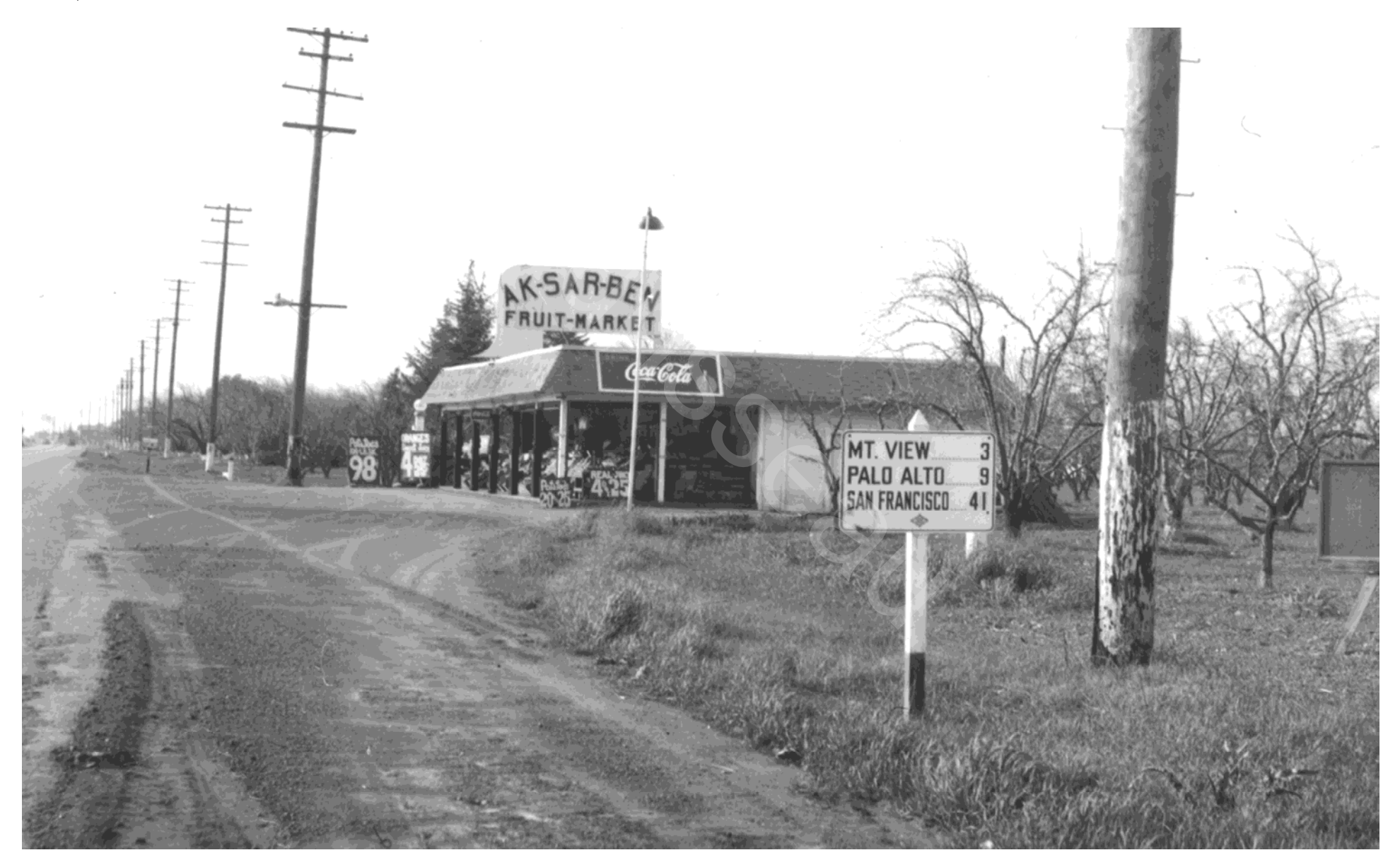
21) 1940: We suspect that many motorists who stopped at the AK-SAR-BEN Fruit Market, located on El Camino Real near Santa Clara, asked the proprietor to explain its Arabic name. "AK-SAR-BEN," he would have replied, was NEBRASKA spelled backwards, and the Knights of AK-SAR-BEN had been founded in 1895 with the noble purpose of keeping the Nebraska State Fair in Omaha — thus preventing its move to Lincoln!